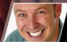
Judson Laipply Internet Personality