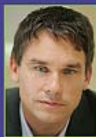
MARCUS BUCKINGHAM Author of First, Break All the Rules