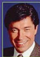
ROSS SHAFER Author of Nobody Moved Your Cheese