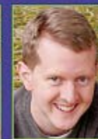
KEN JENNINGS Multi-million Dollar Jeopardy! Champion