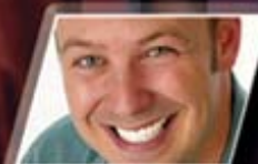
Judson Laipply Internet Personality